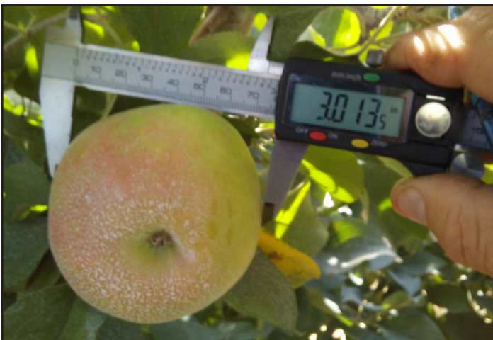
Penergetic apples were an average 1/4" larger in diameter

Seasonal Foliar Application: three applicatonis X 100 ml/acre penergetic p applied at the following stages: 1) leafing 2) flowering 3) budding