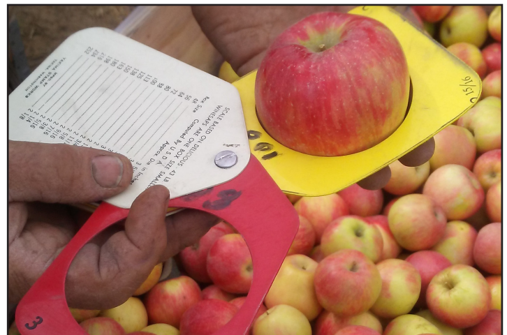
Penergetic apples = higher quality & color and only 12% culls.